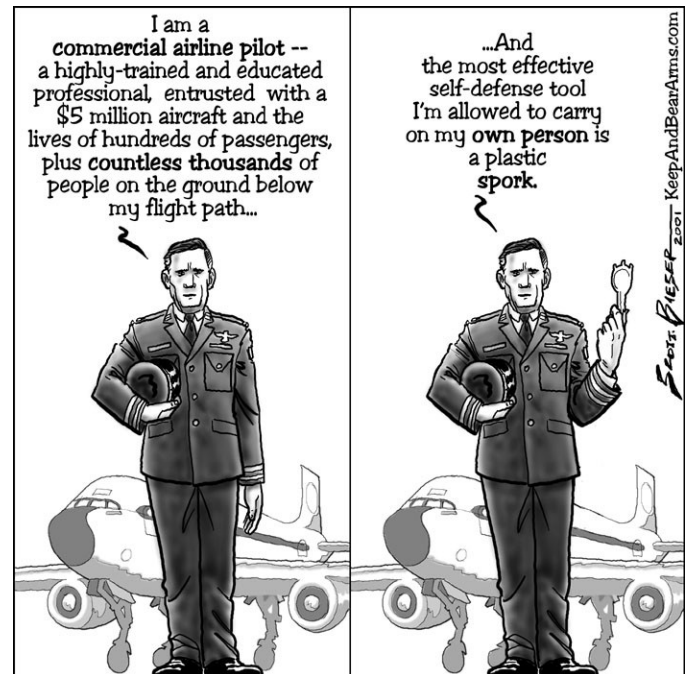
Airline Pilot